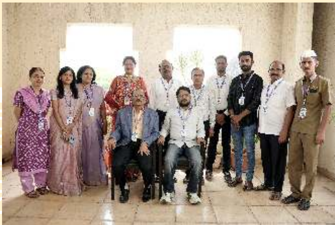
E & TC DEPT.