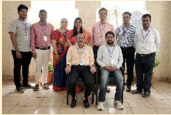
INFORMATION TECHNOLOGY DEPT.

The full time faculty is exposed continuously to industrial operations so as to keep in touch with the latest development in technical fields. Staff members are deputed for various training programs.