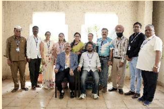
ELECTRICAL ENGINEERING DEPT.