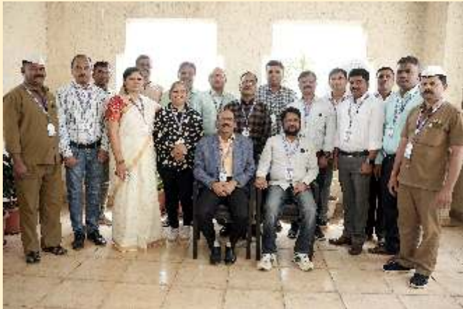
MECHANICAL ENGINEERING DEPT.