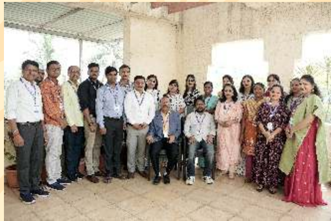
COMPUTER TECHNOLOGY DEPT.