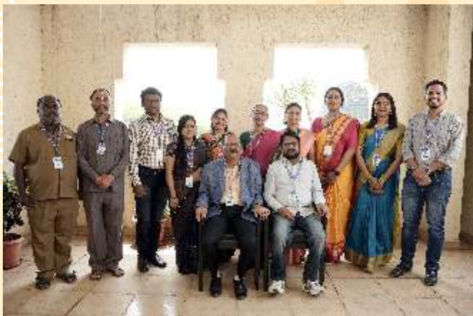
CIVIL ENGINEERING DEPT.