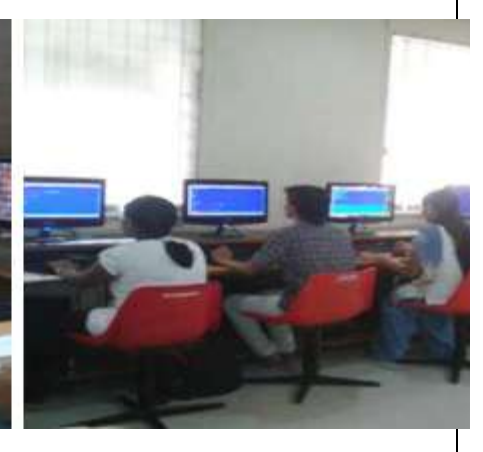
Electronics & Telecomunication