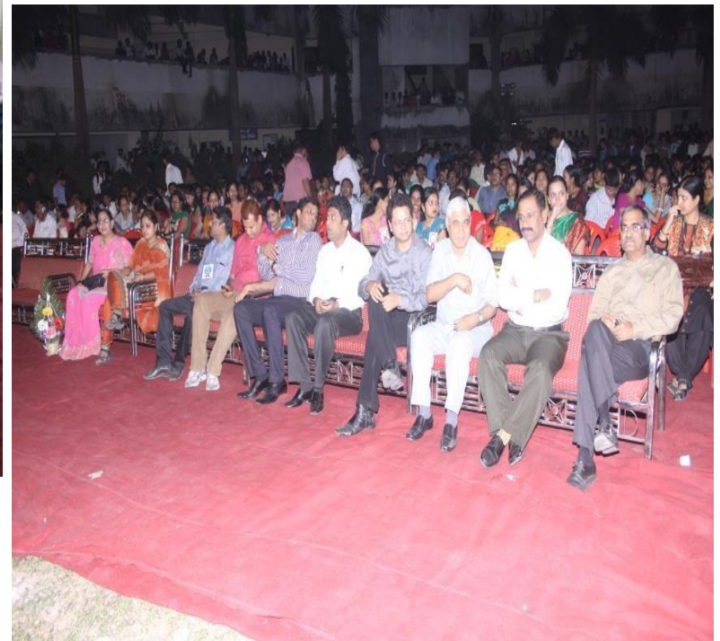
Open Air Theaters