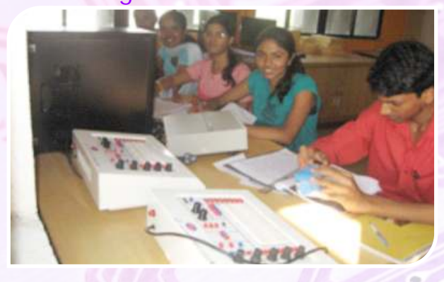
Applied Electronics Lab