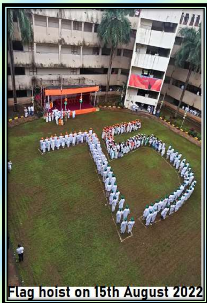
Flag hoist on 15th August 2022