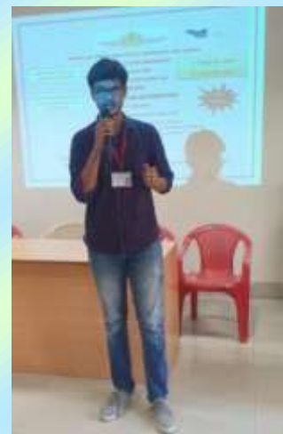
Some of the participants delivering their speech