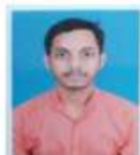
RAI DEV 96.21%