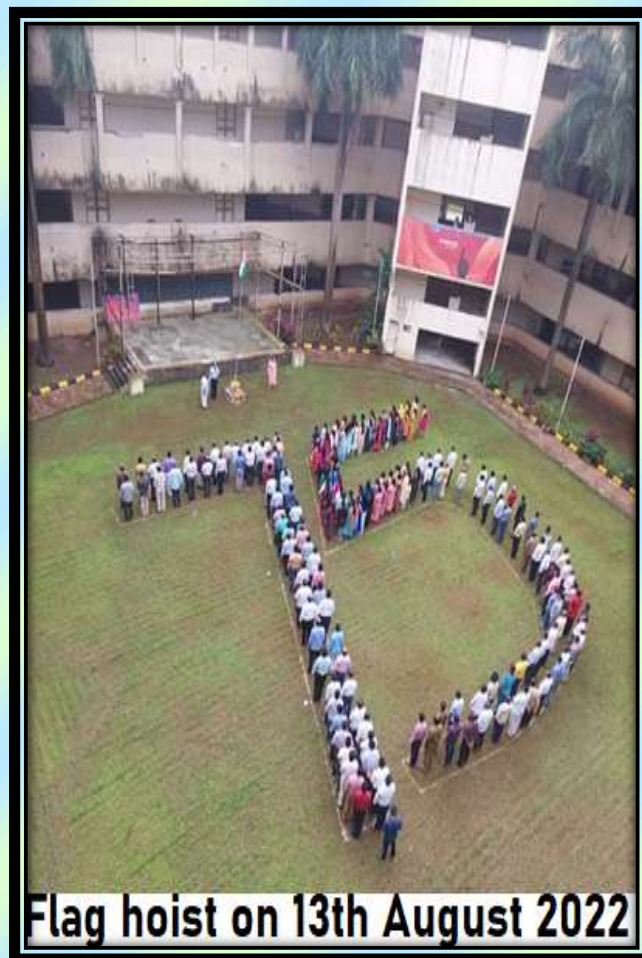
Flag hoist on 13th August 2022