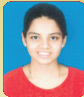
SHATARATHA NAVALE FYCH